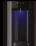
Black - Countertop