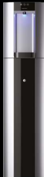
Silver - Floorstanding