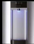
Silver - Countertop

Installation Kit with 3M Filter Contains 3M carbon filter and parts required for easy installation.