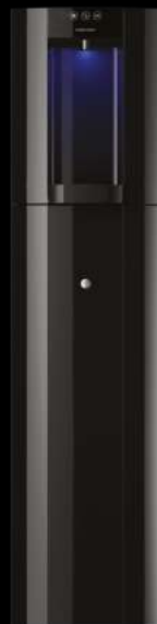
Black - Floorstanding