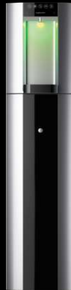
Silver - Floorstanding