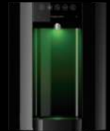
Black - Countertop