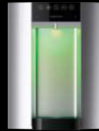
Silver - Countertop