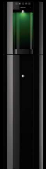
Black - Floorstanding